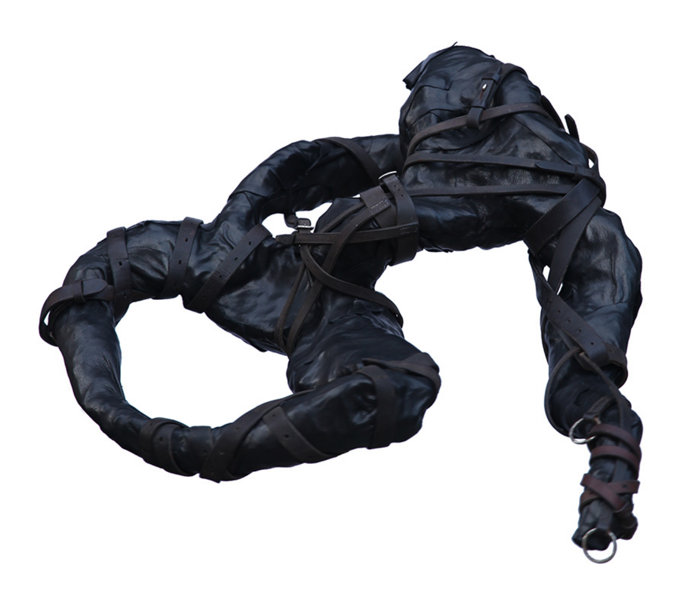
The spirits that I summoned. Spirit III Leather sculpture, free standing on black steel pole with base Dimensions variable – hight about 200cm. £8900