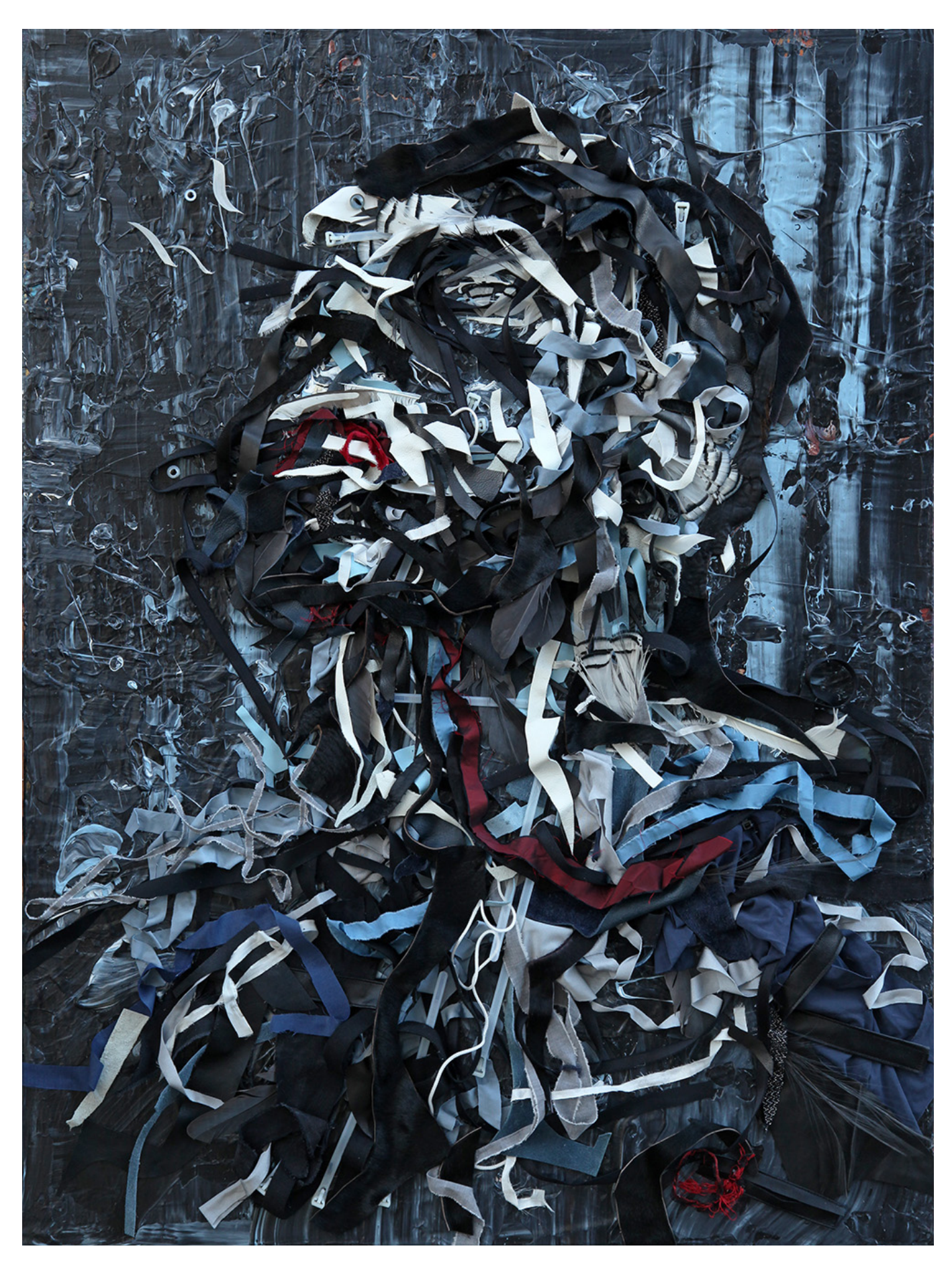
Crossbreed II Mixed-Media Assemblage on painted canvas. 101.5 \text{cm} \times 76 \text{cm} \times 4 \text{cm} . £2800