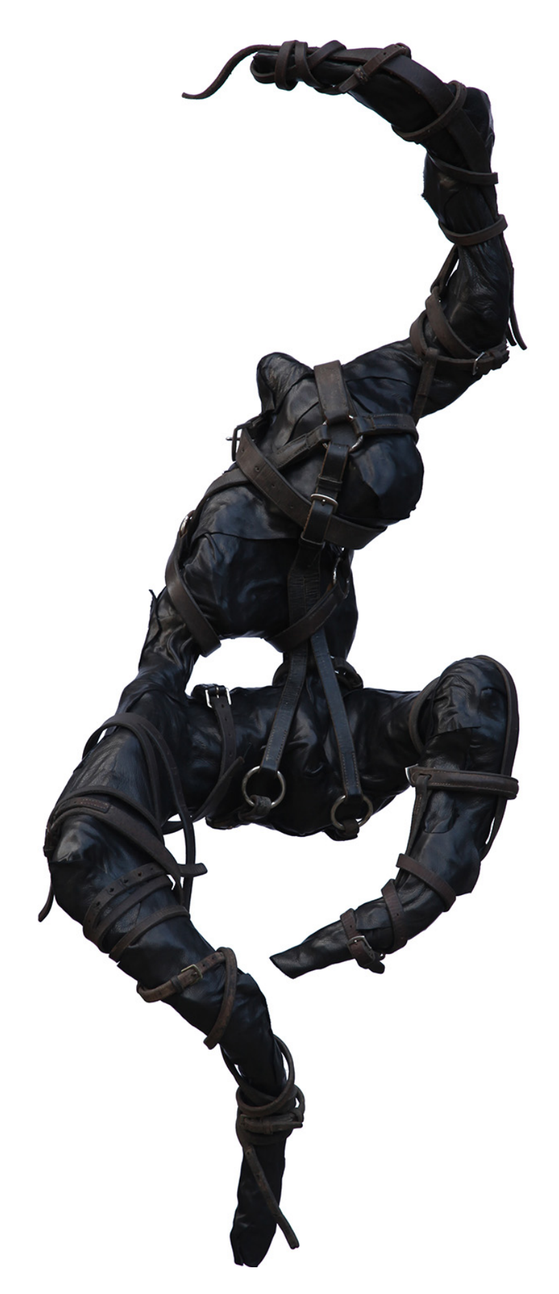
The spirits that I summoned. Spirit I Leather sculpture, free standing on black steel pole with base Dimensions variable – hight about 200cm. £8900