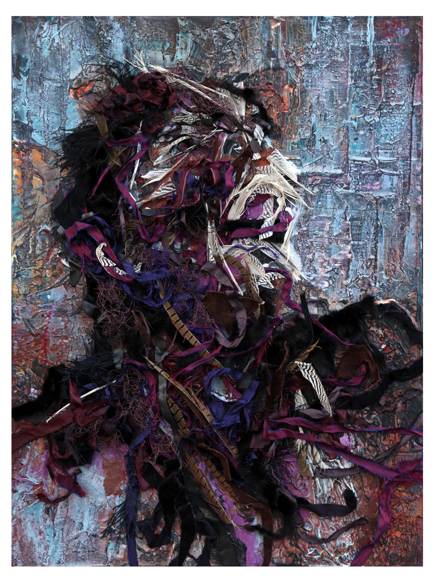
Crossbreed I Mixed-Media Assemblage on painted canvas. 101.5cm x 76cm x 4cm. £2800